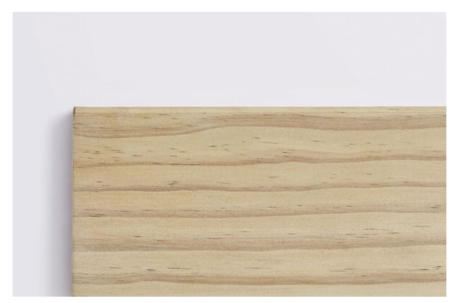
Sand Decking - Pearl Protector Oil