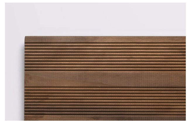
Vulcan Decking - Uncoated