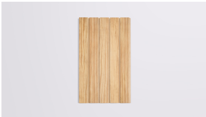
26x68 Rhombus Smooth