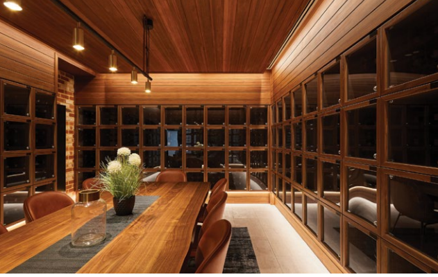
Vulcan Panelling and Joinery (Custom Profiles) in Protector - Teak