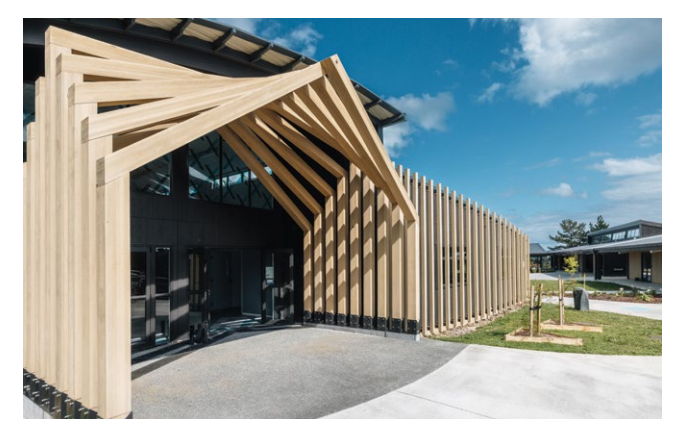
Vulcan Screening in Protector - Straw