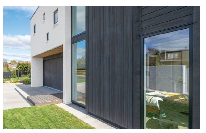
Vulcan Nexus Cladding in Protector - Graphite