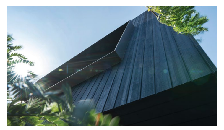
Vulcan Cladding (WB10 Profile 138x20) in Protector - Ebony