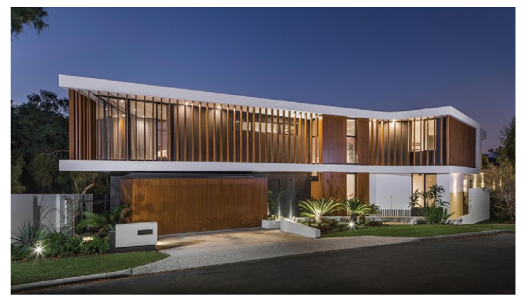
Vulcan Screening (180x42) in Protector - Teak