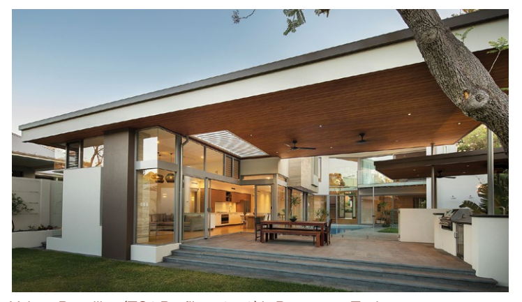
Vulcan Panelling (TG9 Profile 140x10) in Protector - Teak