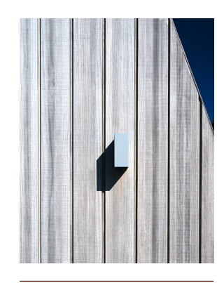
Sioo:x on Vulcan - 18 months