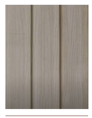
Sioo:x on Vulcan - 4 months