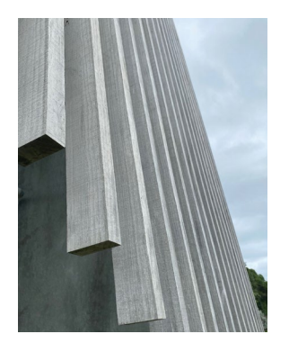
Sioo:x on Vulcan - 5 years