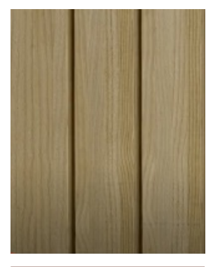
Sioo:x on Vulcan - 2 months