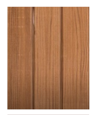
Sioo:x on Vulcan - 1 day

Airborne fungal spores and especially mould spores are a normal component of the outdoor air. Spores are released into the environment from fungi growing on dead or decaying organic matter in the soil or elsewhere in the environment. Fungal spores can settle on surfaces and can germinate when moisture or high humidity is present and create darkening of the timber particularly in south facing aspects and when there is a high degree of moisture and or adjacent vegetation. When this occurs the surface should be cleaned as soon as possible with Maintenance Wash.