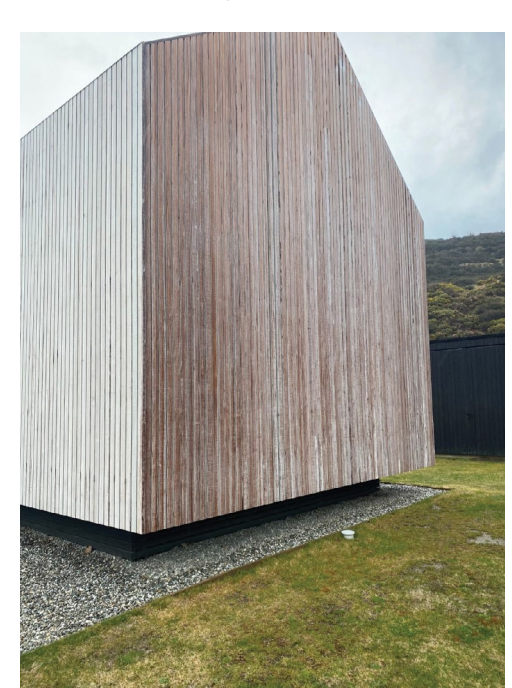
When wet, the appearance of Sioo:x coated timber will change, becoming darker in colour and patchy. As the timber dries, the colour will lighten back to its original appearance.

Traditional coating products fade with exposure to UV from the sun resulting in the problem of uneven weathering to different faces of a building.