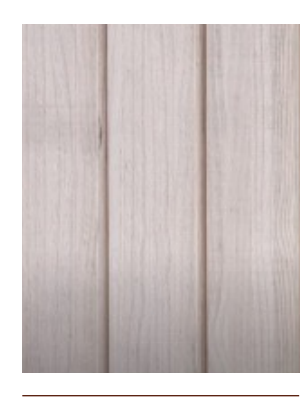
Sioo:x on Vulcan - 6 Months