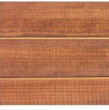
Manuka weathered after 6 months