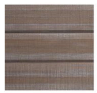
Protector - Graphite