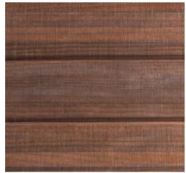
Protector - Teak