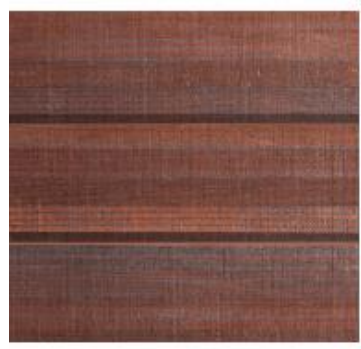
Protector - Manuka