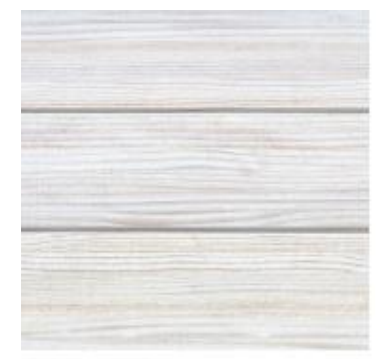
Sioo:x Coating Weathered 3 months exterior only