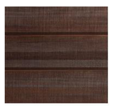
Protector - Walnut