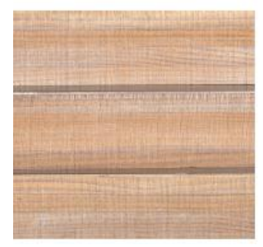
Protector - Straw