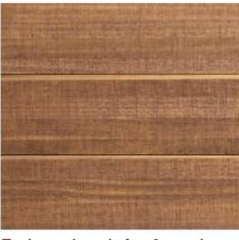
Teak weathered after 6 months