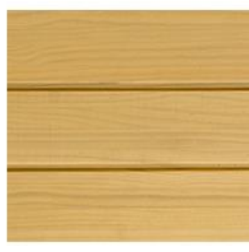
Straw weathered after 6 months