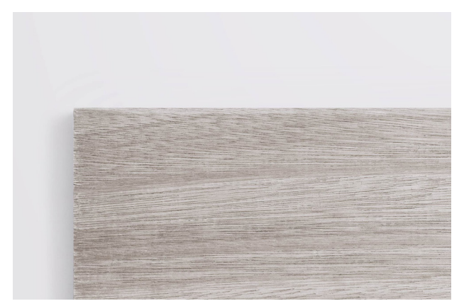
Terra Decking - Sioo:x