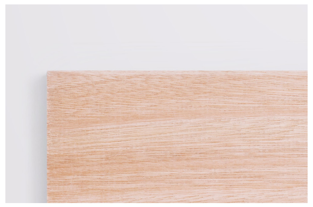
Terra Decking - Uncoated