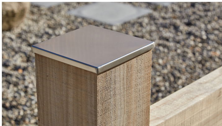
End Caps on Vulcan Screening