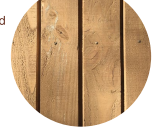
Tundra - weathered 12mo