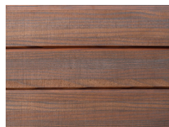
Vulcan Teak As delivered