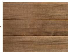
Vulcan Teak Weathered exterior install

We cannot guarantee against wear or color changes to any products which result from weather, sun, wind and/or the natural aging process of the wood.