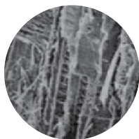
Cell structure – normal kiln dried timber